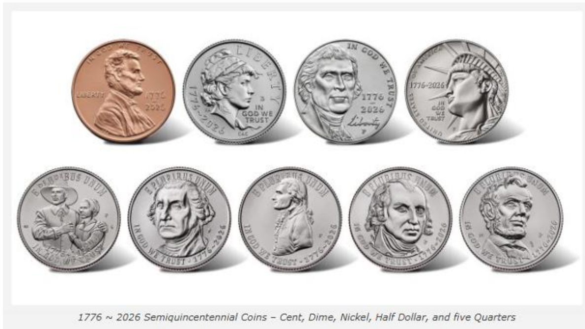
1776 ~ 2026 Semiquincentennial Coins – Cent, Dime, Nickel, Half Dollar, and five Quarters

The U.S. Mint is issuing special circulating coins to celebrate the 250th anniversary of American's adoption of the Declaration of Independence .